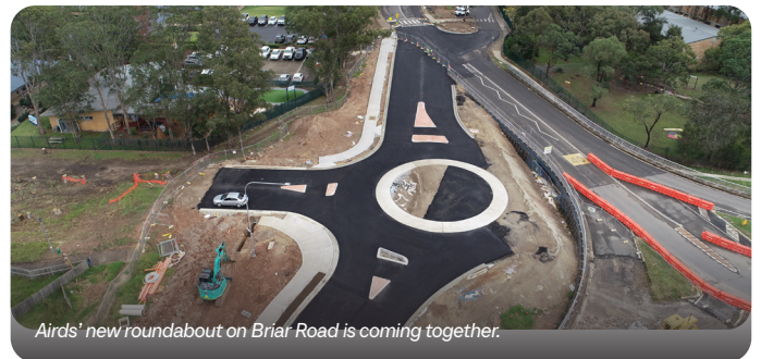
Airds' new roundabout on Briar Road is coming together.

The subdivision certificate for site 2 is currently under review by Campbelltown City Council. We're working closely together to progress approval and move to the next stage as soon as we can. All lots in site 3 have now been registered, with settlements expected this month.