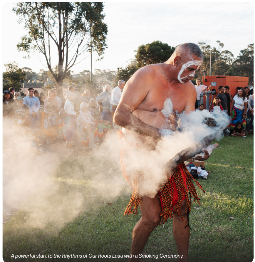
A powerful start to the Rhythms of Our Roots Luau with a Smoking Ceremony.

The evening opened with a Smoking Ceremony and brought the community together through food, music and storytelling, celebrating culture, strengthening connections and building a strong sense of belonging.