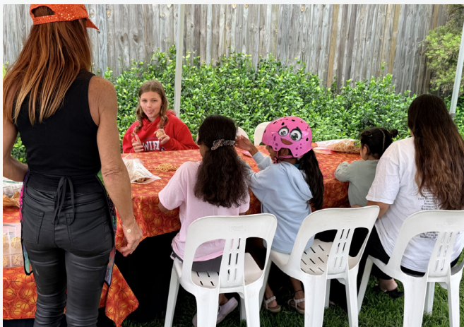
Kids enjoying a bouncy ball making workshop at the February event.