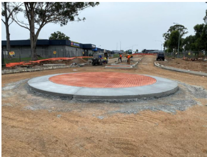
Towner Avenue roundabout taking shape.

Work on Stage 7A is progressing well. Completion is now anticipated in mid-2026 due to delays in external enabling works. This will realign the Riverside Drive and Briar Road intersection to create a safer and more efficient road network for the community.