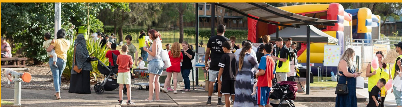
The community enjoying a free event at AB Central.

This work was made possible through partnerships led by Homes NSW together with local schools and community organisations, helping build pride, opportunity and connection across the community.