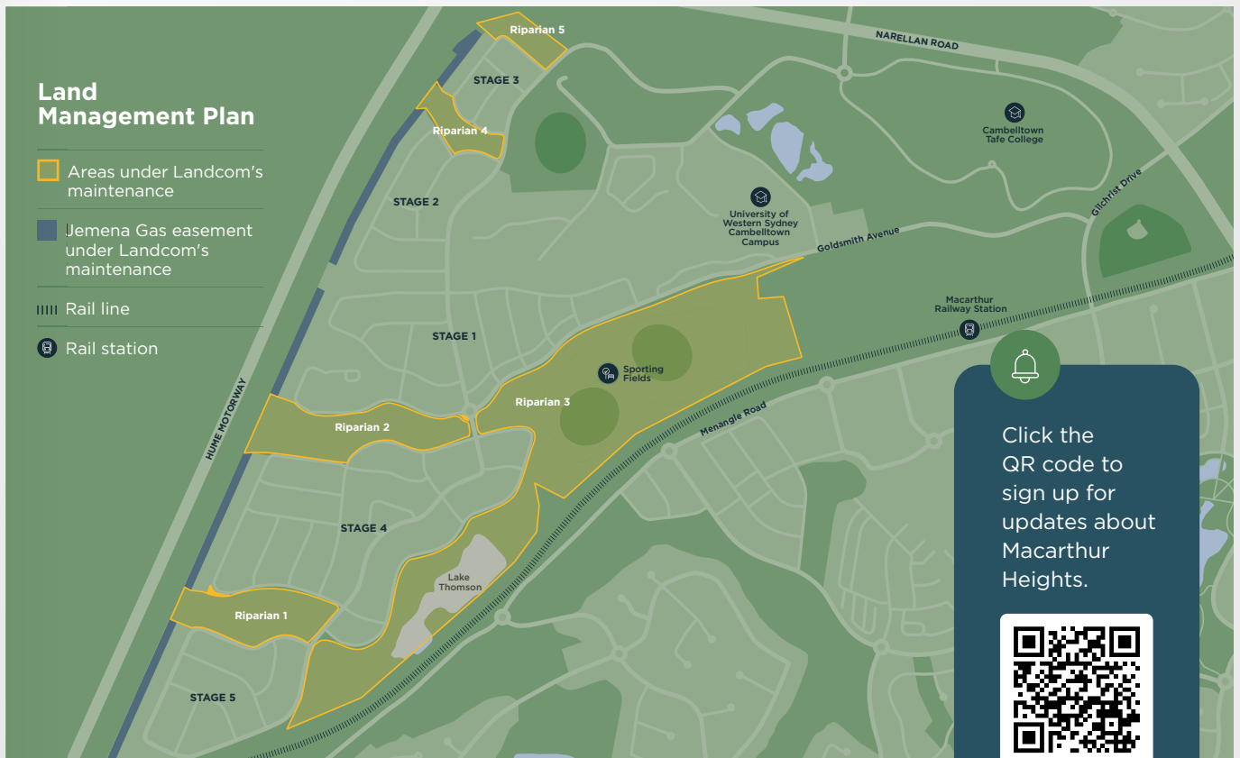
Macarthur Heights Land Management Plan

Spring has sprung! As the weather warms you may notice that green spaces across Macarthur Heights are quickly overgrown. Please use the map below to identify maintenance responsibilities, and don't hesitate to contact us if you have any questions.