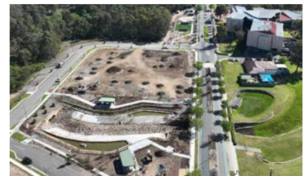
Drone footage of progress on open spaces at Macarthur Gardens North