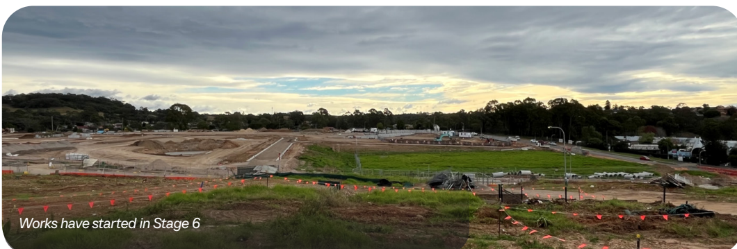
Works have started in Stage 6