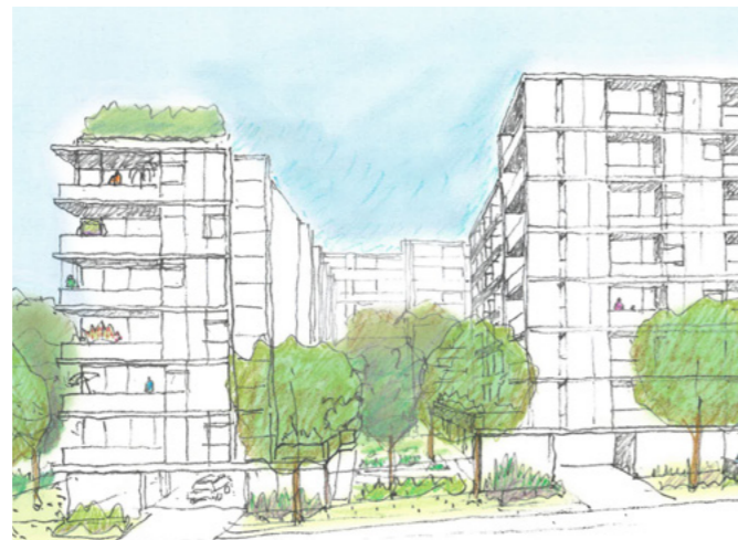
Affordable housing artist impression of the view into the courtyard from the street. Subject to change and approvals.

In December, we will lodge a development application for Stage 2 to subdivide land and create the opportunity for future detached houses and terrace houses (refer to map on page 4).