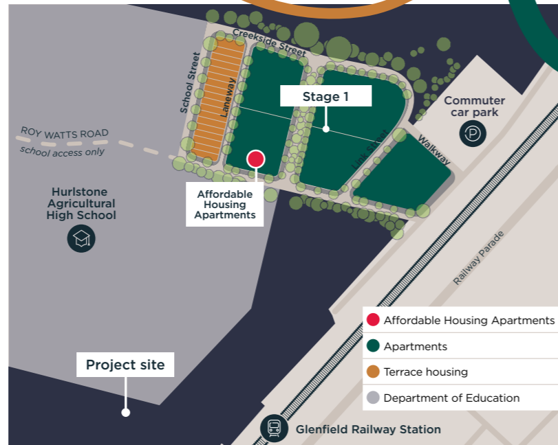
Image showing Stage 1, street locations and land subdivisions.