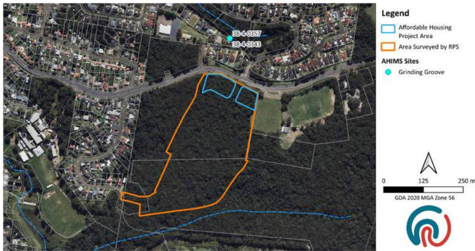
Figure 3 Grinding grooves have been identified in the creek (although registered under two AHIMS numbers - AHIMS 38-4-0357, AHIMS38-4-0343, it is actually one site which has been registered twice)