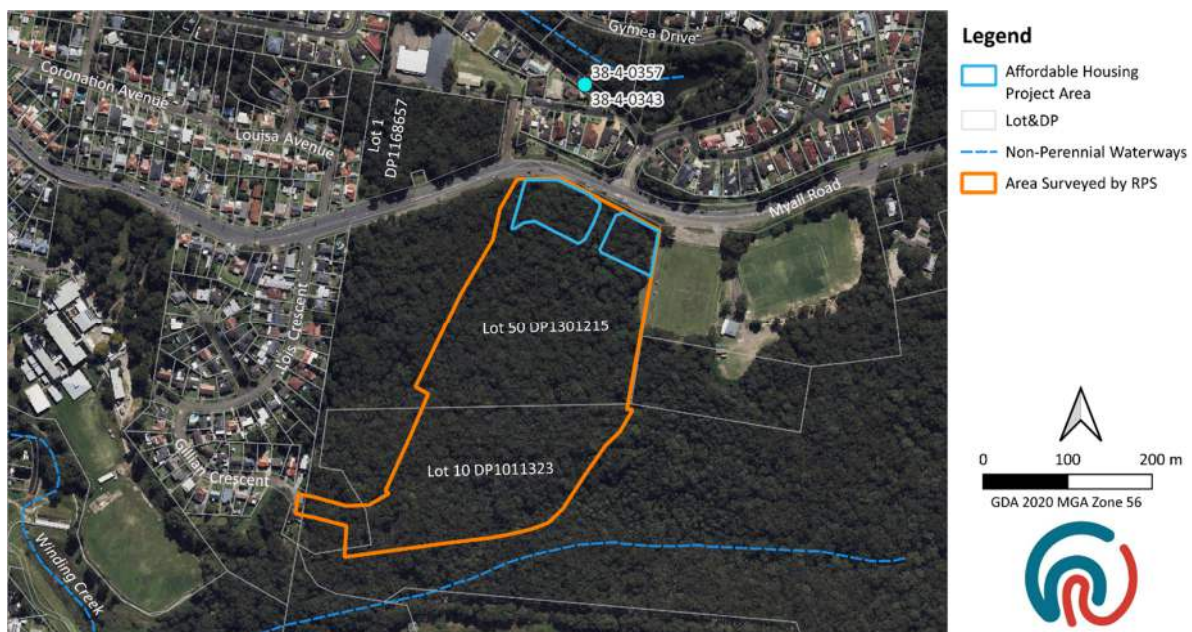
Figure 1 Affordable Housing Project Area

The proposed affordable housing site is located in the northern portion of Lot 50, DP1301215 (Figure 1). This portion of the Project Area has also been assessed under an Aboriginal Heritage Due Diligence report (RPS 2012) and no Aboriginal objects or areas of Aboriginal cultural sensitivity were identified.