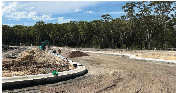
New roads preparation

In the coming months machines will work along Myall Road to install water services and to improve water pressures to the surrounding area.