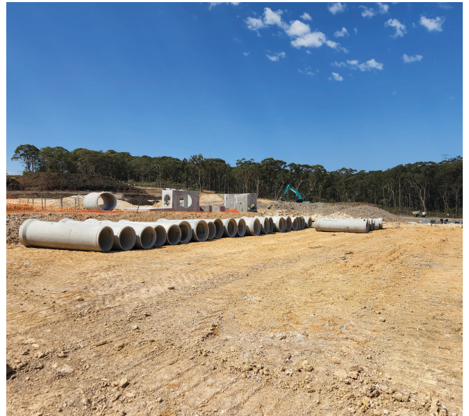
Underground services being installed