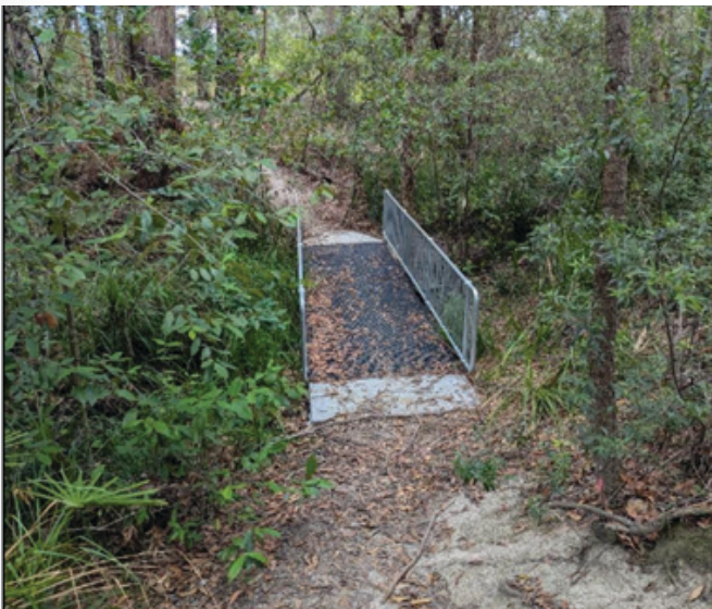
Restoration of walkways over waterways

The majority of bushland is still open to the community and can be accessed via multiple entry points and walking trails in the eastern side of the stewardship site. We encourage visitors to stay on the marked paths to help protect this important habitat over the long term.