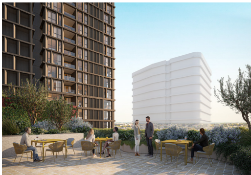
Artist's impressions of proposed development, subject to change and approvals (clockwise from above): looking north from above, new landscaped public outdoor space, looking northeast from Parramatta Road, and communal outdoor space for build-to-rent tenants.