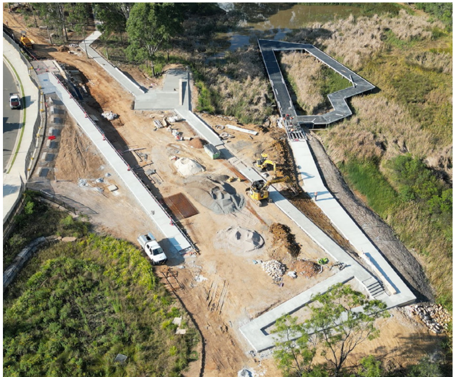
Aerial photo of the boardwalk under construction at Lake Thomson (April 2024)

The delivery of the sportsfields precinct and the Macarthur Regional Recreational Trail are due to commence work later this year. The regeneration of bushland areas along creek corridors has commenced and are progressing well.