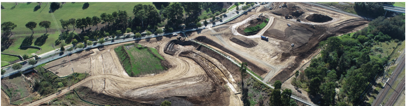
Macarthur Gardens North under construction - April 2024