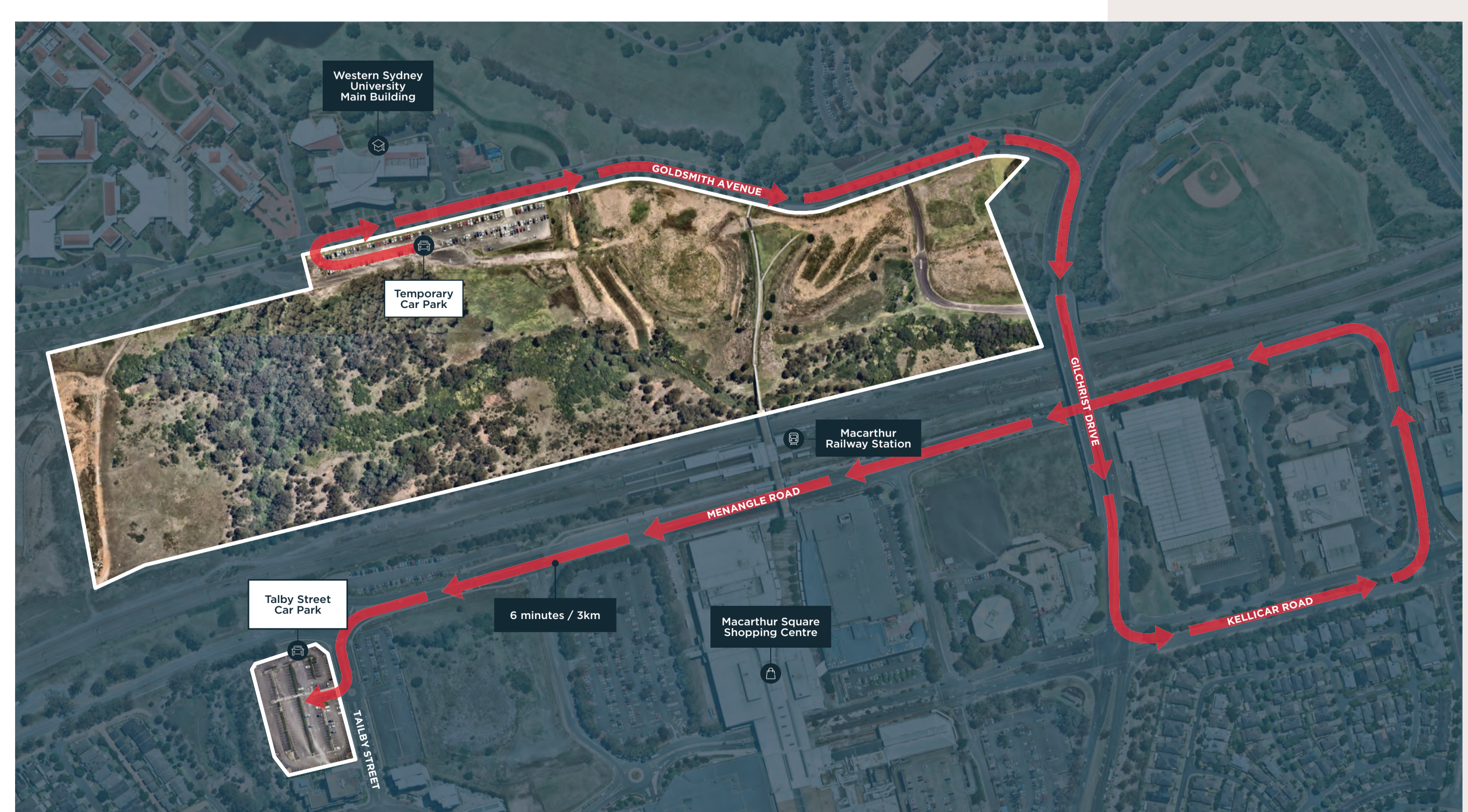
Figure 2 Tailby Street Commuter Car Parking

Western Sydney University's temporary overflow car park on Goldsmith Avenue, located within the Macarthur Gardens North site, will close permanently from Wednesday 1 November so that the site can be developed with new open space and much-needed housing. There is free, all-day commuter car parking on Tailby Street near Macarthur Square.