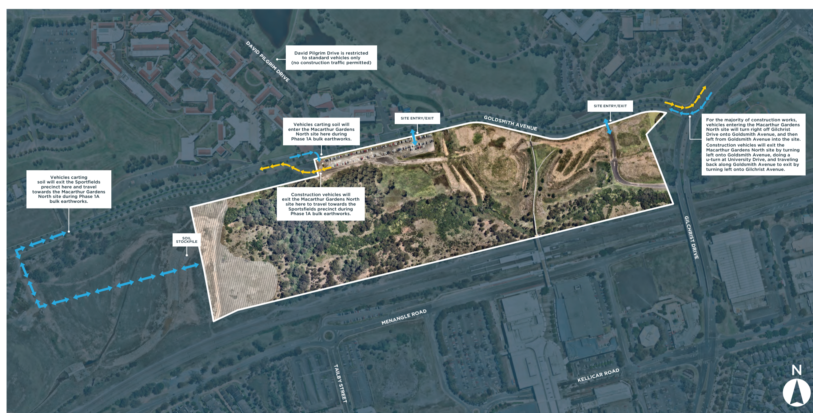
Figure 3 Vehicle Site Access

During the first month of Phase 1A bulk earthworks, soil will be relocated by truck from the Sportsfields precinct at Macarthur Heights to the Macarthur Gardens North site along Goldsmith Avenue. For this component of works, vehicles picking up soil from the Sportsfields precinct will exit the Macarthur Gardens North site by turning left onto Goldsmith Avenue and travelling west to the stockpile site at the Sportsfields precinct. Trucks exiting the Sportsfields precinct will turn right onto Goldsmith Avenue, and then right again into the Macarthur Gardens North site to unload soil. We anticipate up to 80 truck movements across the workday (equivalent to 8 truck movements per hour) will be needed to relocate soil.