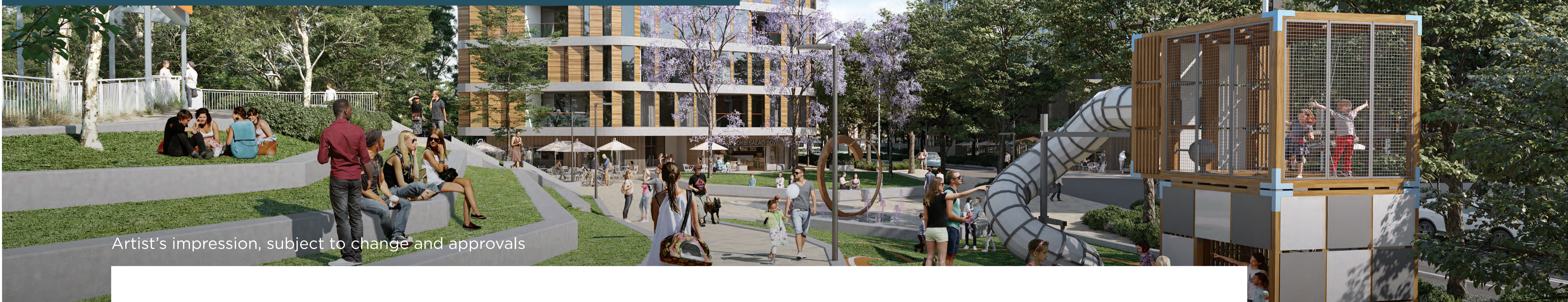
Artist's impression, subject to change and approvals