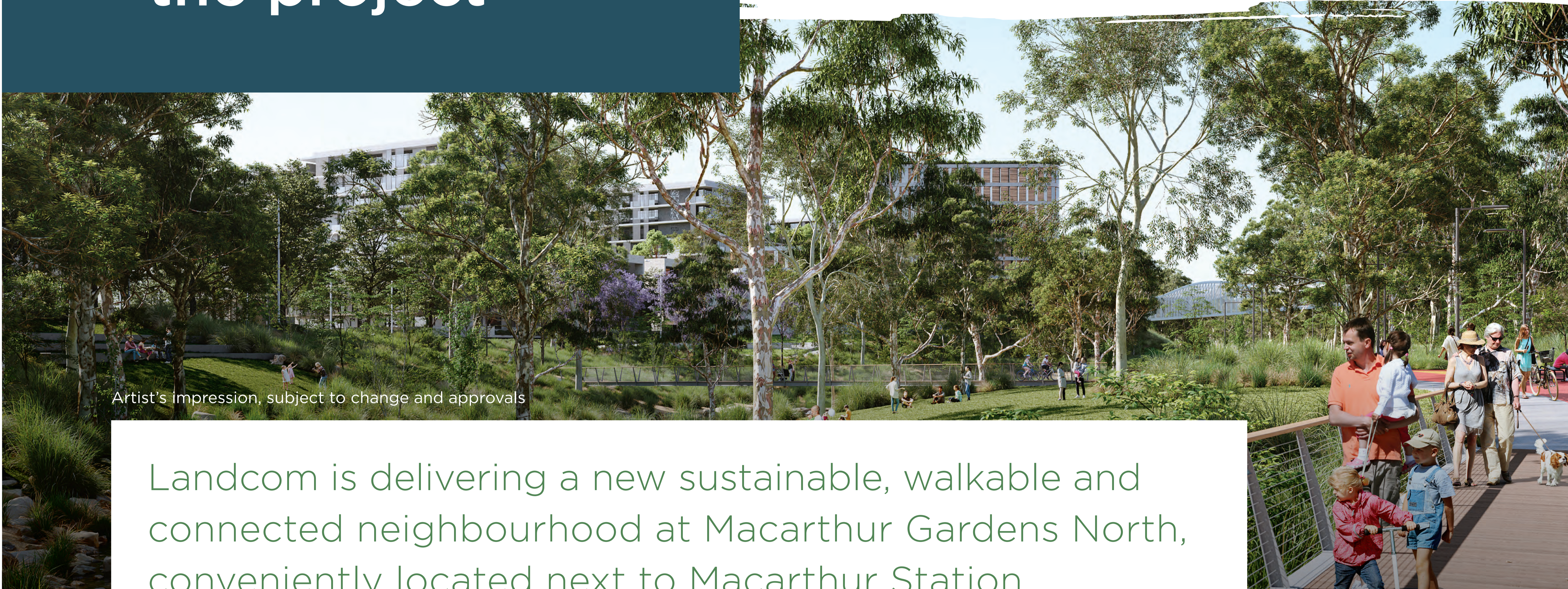
Artist's impression, subject to change and approvals

Landcom is delivering a new sustainable, walkable and connected neighbourhood at Macarthur Gardens North, conveniently located next to Macarthur Station.