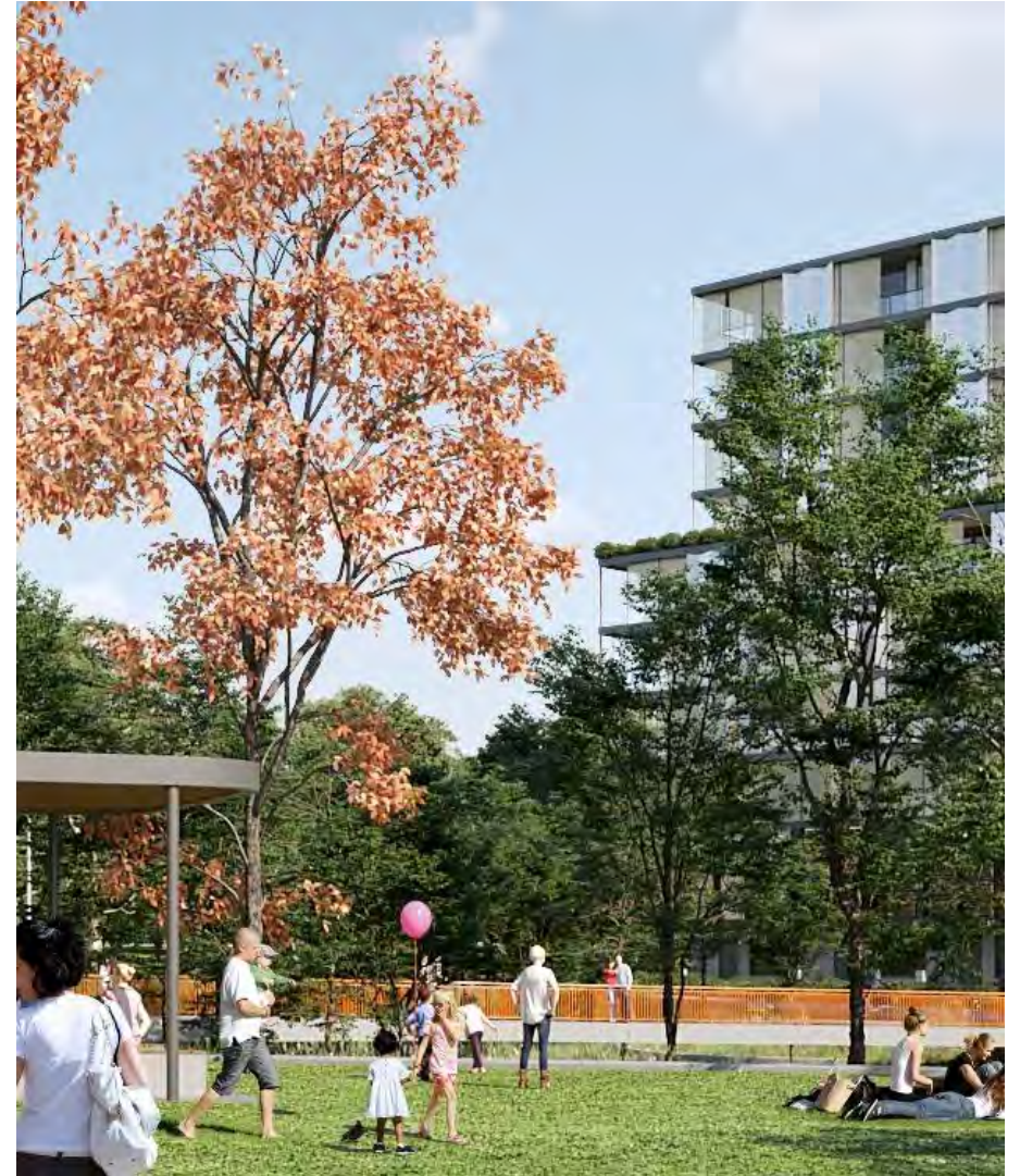
Indicative artist's impression, subject to change and approvals.