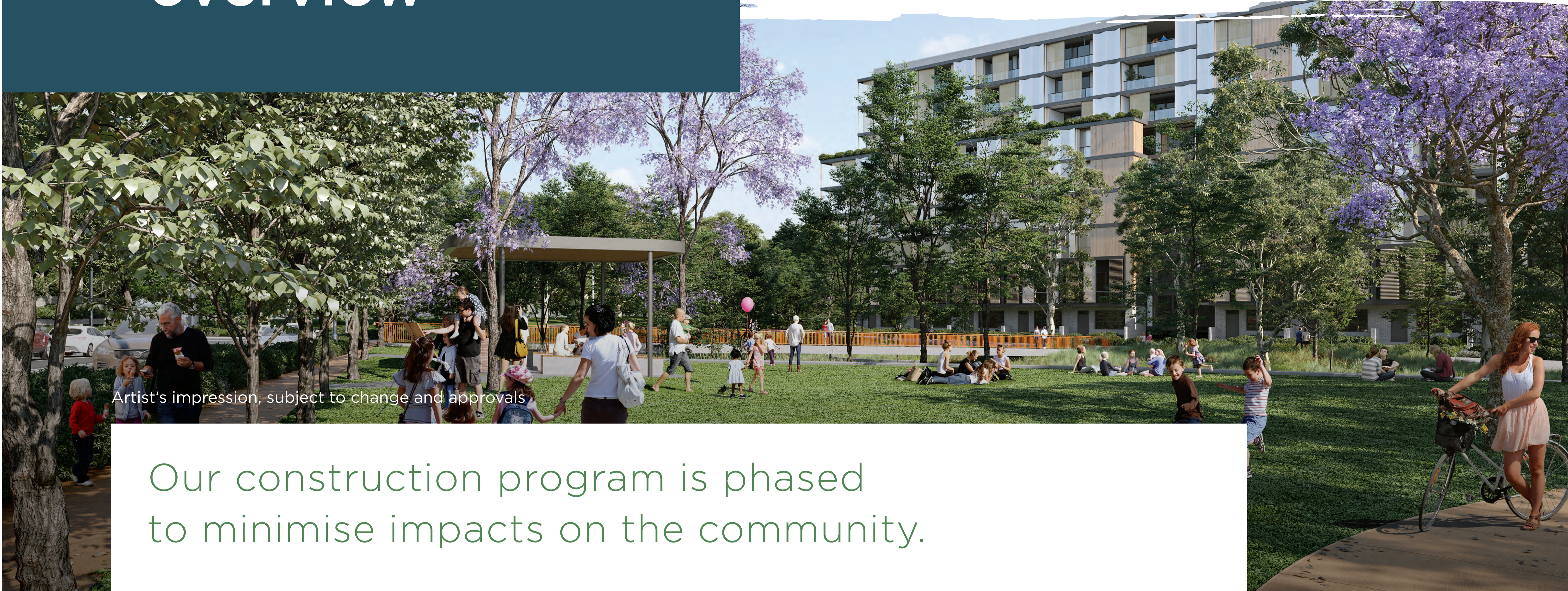
Artist's impression, subject to change and approvals

Our construction program is phased to minimise impacts on the community.