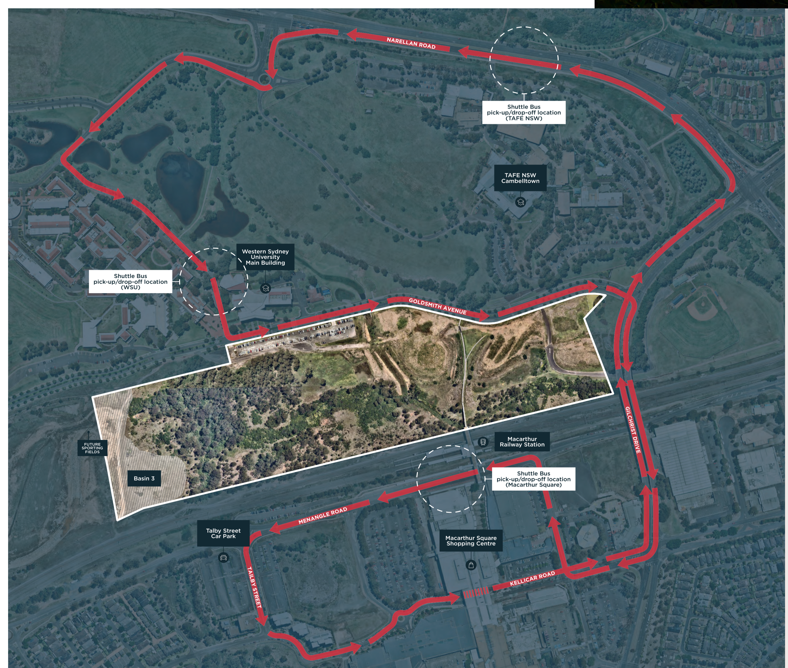
Figure 1 Shuttle Bus Route

The shuttle bus is anticipated to take the following route: