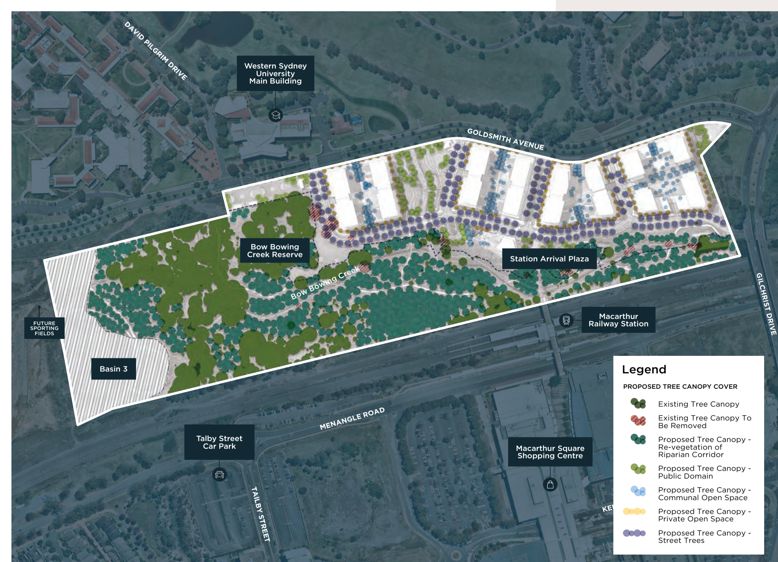
Figure 4 Proposed Tree Canopy