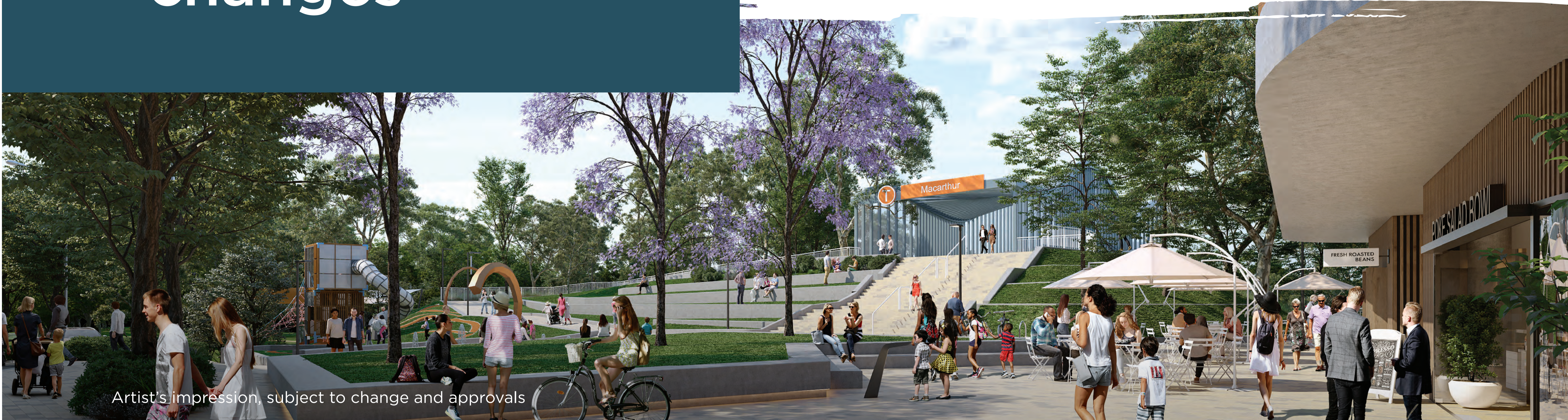
Artist's impression, subject to change and approvals