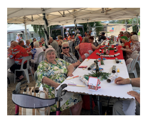
2023 Senior's Luncheon