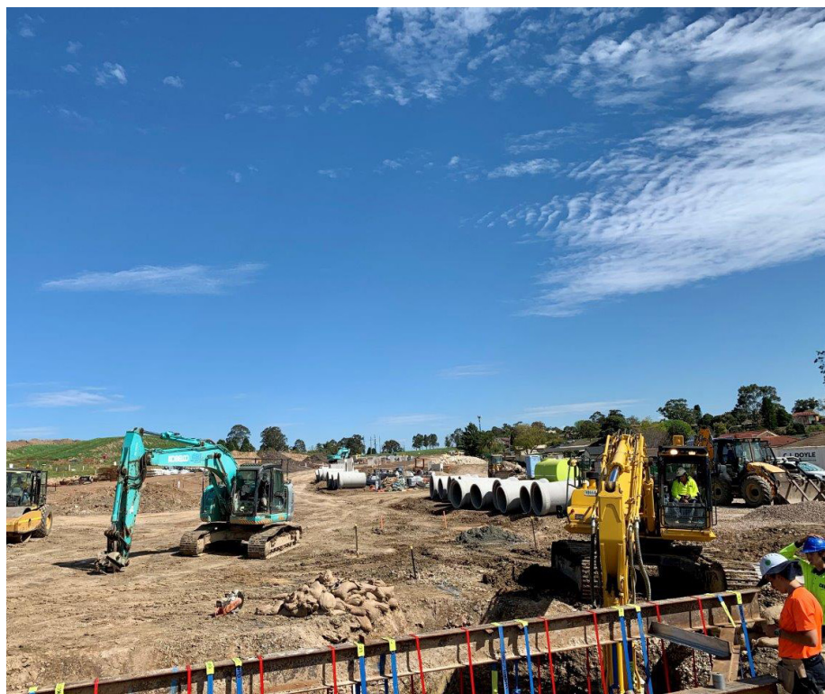
Image - recent photo of Stage 6 works