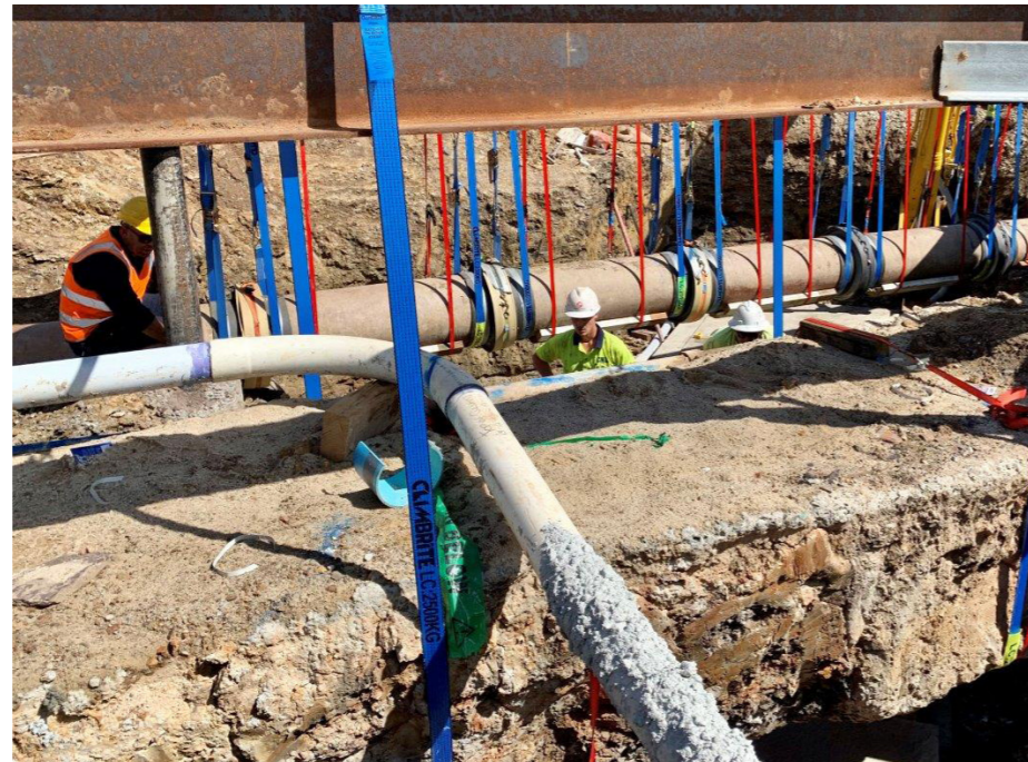
Image - recent photo of Stage 6 works.

We apologise for the inconvenience and thank you for your patience whilst we complete this necessary work.