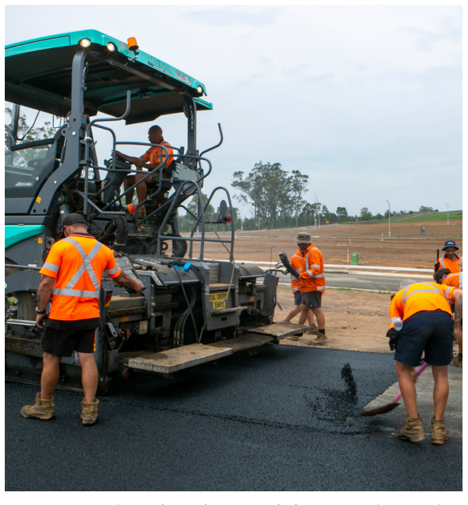
Crews lay PakPave asphalt across Fairway Drive.

The bridge will remain the main access point into North Wilton until the new Hume Highway on and off ramps are built.