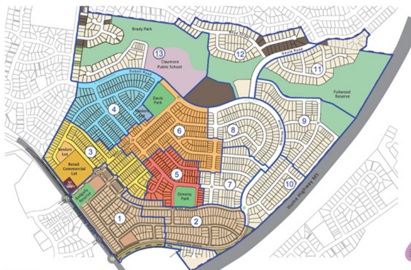
Claymore Stages 3 - 6 Masterplan June 2018

Due to COVID-19 restrictions, all construction works have been suspended until NSW Health advises that works can resume.