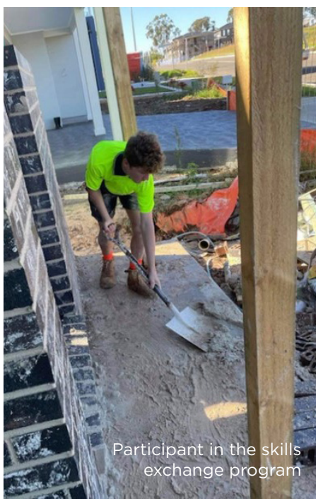
Participant in the skills exchange program